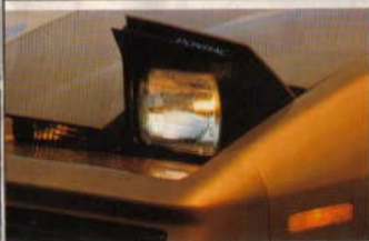
Electrically-operated retractable halogen headlamps are standard on all Firebirds.