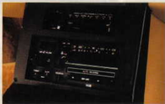
This available Delco-GM-AM/FM stereo and cassette includes dual extended range rear speakers.