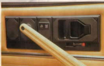
Firebird's new flush-mounted door handles. Convenient power door locks are available.