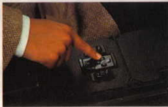
Dual, electrically-operated sport mirrors are available on all Firebirds.