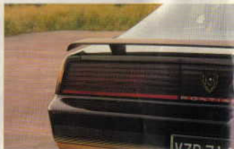
Trans Am features a rear deck-mounted aero-wing spoiler, which is also available on the S/E.