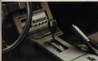
Firebird's integral front console. Automatic transmission and power windows are available.