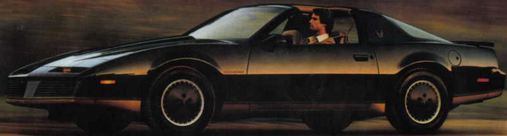
FIREBIRD TRANS AM